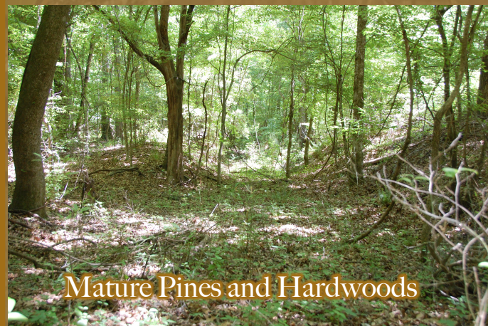
Mature Pines and Hardwoods