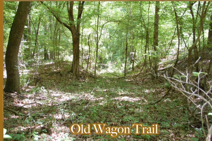
Old Wagon Trail